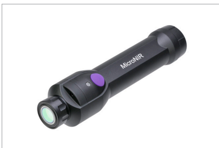
MicroNIR OnSite-W Instrument

The MicroNIR OnSite-W is the smallest fully-integrated NIR spectrometer on the market and is enabled by proven VIAMI linear variable filter (LVF) technology. With no moving parts and IP65/IP67 dust/water ingress rating, it is designed for a wide range of material characterization applications in food, agriculture, pharmaceutical, and security markets.