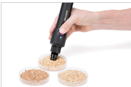
MicroNIR OnSite-W in application