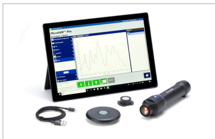
MicroNIR OnSite-W Kit running MicroNIR Pro application (tablet not included)