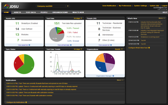
Example of StrataSync dashboard