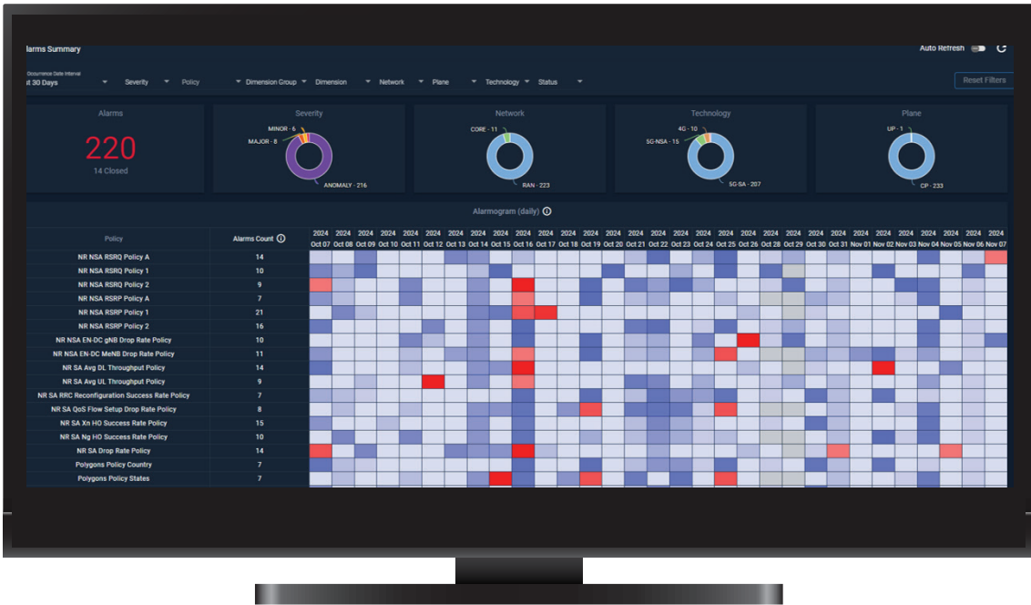
A single pane view of all alarms and anomalies detected

The Alarmogram view provides a comprehensive visual representation of all your policies over multiple days, allowing you to see them simultaneously in a structured format. The intuitive layout helps to quickly identify patterns, anomalies, or specific policies at a glance, making it easier to analyze and manage alerts efficiently.