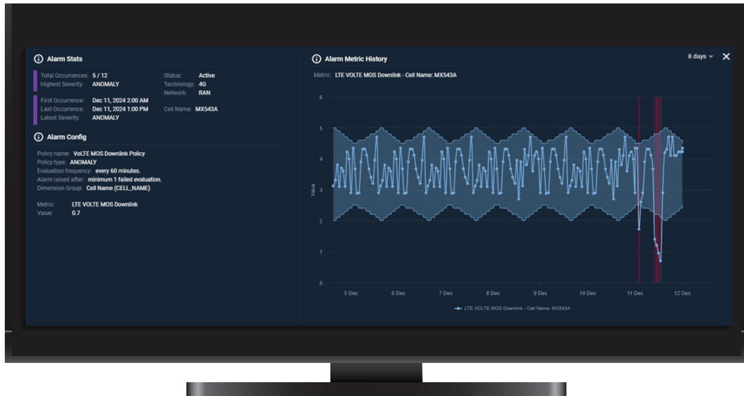
Alarm Metric Stats

NITRO Anomaly Detection solution seamlessly integrates into existing network monitoring systems, leveraging real-time KPI generation and AI-driven analytics to detect and prioritize network anomalies.