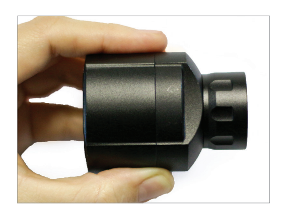
MicroNIR 1700 EC

The MicroNIR 1700 EC uses the same optical engine as the MicroNIR OnSite-W and PAT family and is designed for exploratory data analysis and model development. An OEM version is available.