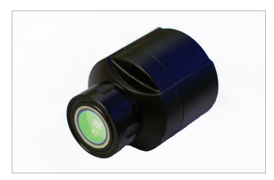
MicroNIR 1700 EC