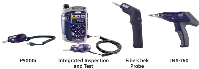
P5000i Integrated Inspection and Test FiberChek Probe INX-760