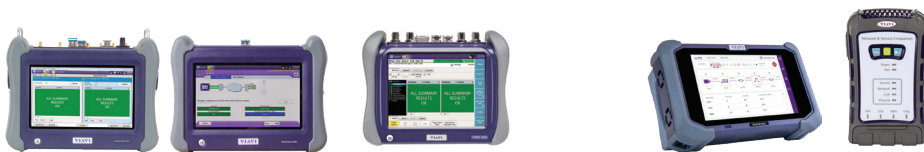
T-BERD/MTS-5800 100G and SmartClass 4800 T-BERD/MTS-5800 Handheld to 100G, MetroE, Cell Backhaul, 10 GE, TrueSpeed, PRI-ISDN, VoIP (SIP), Fiber Testing OneAdvisor 800 and Network and Service Companion (NSC-100/200) Modular Test Platforms (Transport to 100 G), Ethernet 10 Mbps to 100 G, DS1 to OC-192, CPRI, Fibre Channel, TrueSpeed, One-Way Latency, Fiber Testing