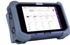
OneAdvisor 800 Advanced Fiber Characterization Kit OTDR, PMD, CD, AP