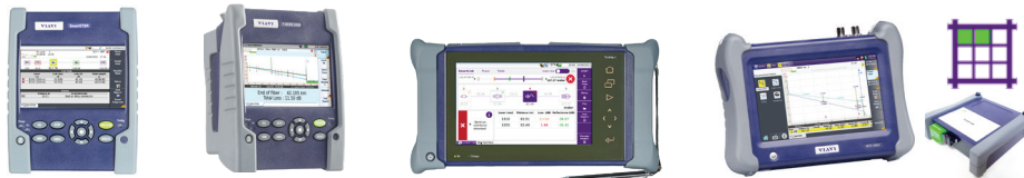
SmartOTDR T-BERD/MTS-2000 Handheld Modular Test Set T-BERD/MTS-4000 V2 Dual Module Mainframe T-BERD/MTS-5800 with MPO Switch and Cable-SLM

OTDR, CWDM & DWDM OTDR, and PON-optimized OTDR modules