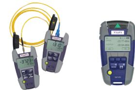
Smart Pocket V2 Kit Light Source and Power Meter SmartClass Fiber OLP-37XV2/39 TruePON PON and XGS PON Power Meter