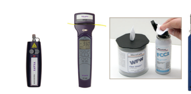
Visual Fault Locator (VFL) Live Fiber ID Fiber Cleaning