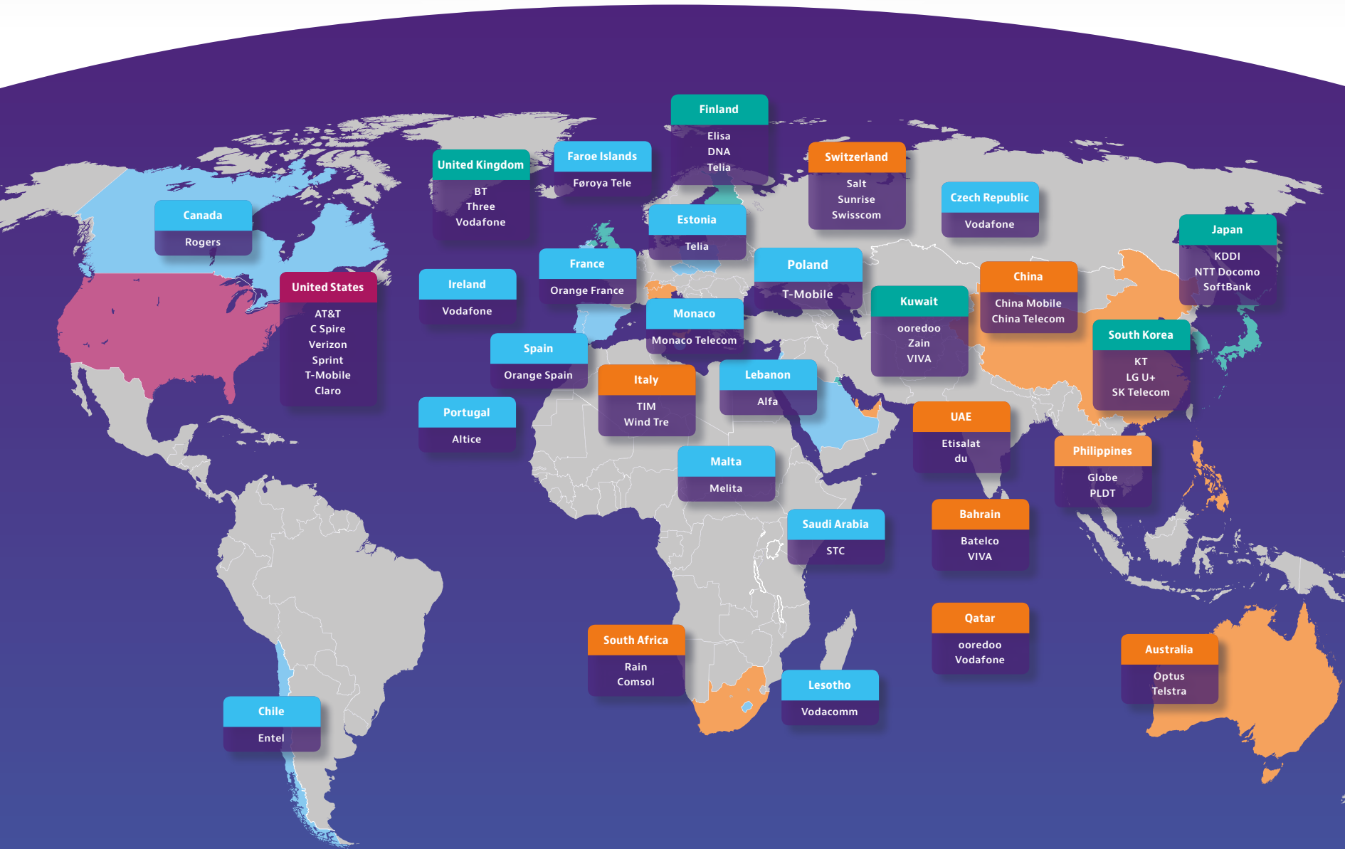
NUMBER OF OPERATOR LAUNCHES:

Shows the existing 5G networks and the 5G launches that operators have publicly announced will be operational before the end of 2019