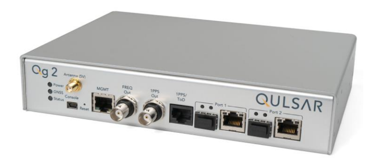
Figure 1 Qg 2

Qg 2 is a small form factor, highly accurate Multi-Sync Gateway that provides IEEE 1588 PTP Grand Master and Boundary Clock functionality. It addresses the needs of various industries and applications where reliable and precise synchronization is required, especially at the edge of the network, C-RAN and Fronthaul, and Enterprise.